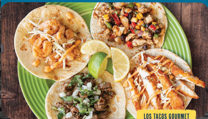
LOS TACOS GOURMET

Ground beef or shredded chicken on a crispy shell, topped with lettuce and cheese.