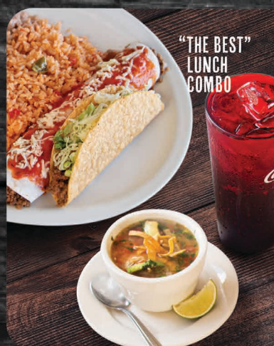
"THE BEST" LUNCH COMBO