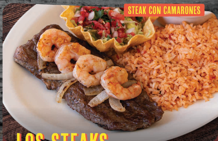
STEAK CON CAMARONES

Marinated grilled chicken breast with bbq sauce, melted cheese. Served with rice, sour cream, lettuce & pico de gallo.